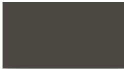
Musket SR-30.10 E-.85 SRI-30