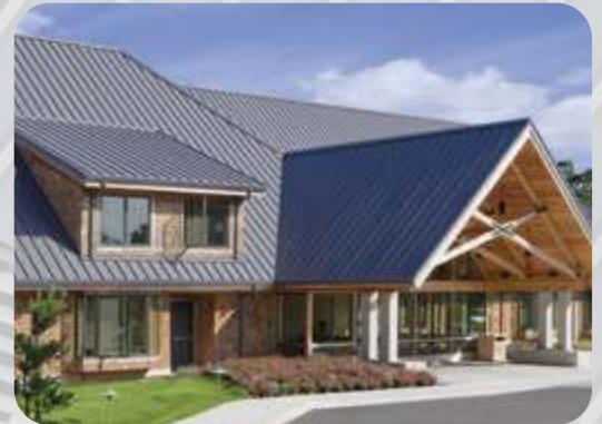
Bandon Dunes Golf Resort