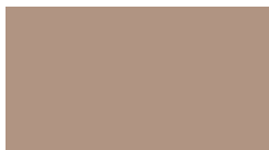
Sierra Tan SR-48.01 E-.87 SRI-55