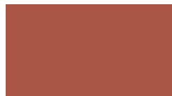
Terra Cotta SR-39.37 E-.87 SRI-43