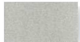
Silver Ultramet*‡ SR-41.13 E-.85 SRI-43