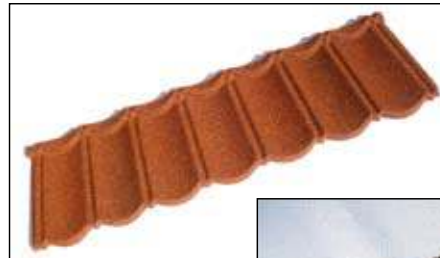
Tile-style stone-coated panel (approx. 15 x 52 in.)

One way to identify a modular panel metal roof is to examine the fascia or rake/gable sections of a structure. Many modular metal roof panels incorporate wide-faced painted or stone-coated metal flashing pieces installed around the perimeter of the roof (see photos).