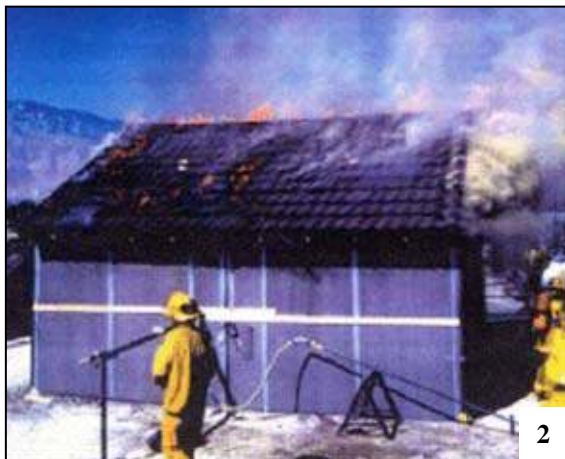
Test building with a stone-coated metal roof during a simulated attic fire.