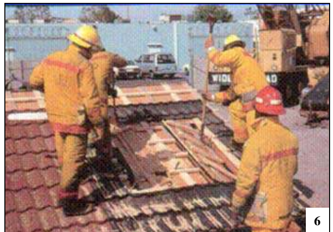
While being lightweight, the shape stamped into the metal makes the panels strong. They can easily be cut with an axe or carbide-tipped chain or circular saw. Though an axe is more than adequate, carbide-tipped chain saws cut through the metal very fast and can remove the sheathing at the same time.