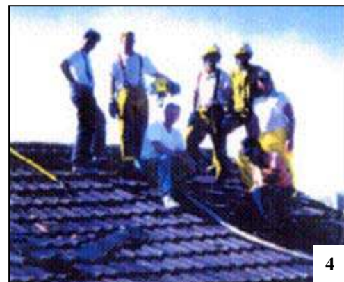
After the fire is extinguished, the entire fire service team assembles on top of the stone-coated metal roof without fearing the threat of roof collapse.