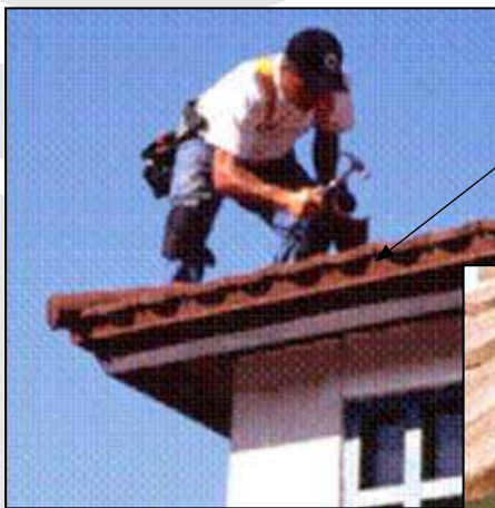
Wide-faced (5-in.) stone-coated or painted metal fascia covers batten framing on roof over applications. The flashing is narrower (3-in. deep) on new construction.