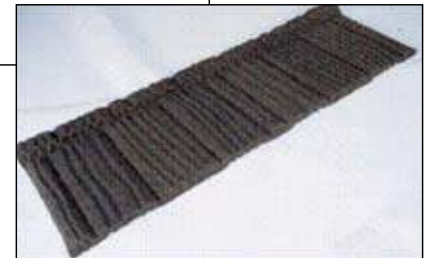
Shake-style stone-coated panel (approx. 15 x 52 in.)