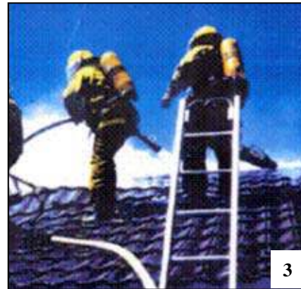
Firefighters on the stone-coated metal roof ventilate the attic by cutting into the roof (but avoid cutting through the rafters) using a carbide-tipped chainsaw with a depth guard set to 3 inches. A slit is cut along the entire ridge line, and then the ridge roofing panels are peeled back to allow water to flow down and inside the roof assembly.