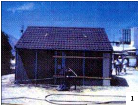
Test building constructed with practices commonly used in California during the 1960s.

The stone-coated metal roof was subjected to the identical pre-heat period, and the structure was allowed to burn for the same 21-minute period as the concrete tile-roofed building. The fire was then extinguished by firefighters employing specific suppression techniques.