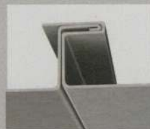
WS-100 AFTER LOCKING