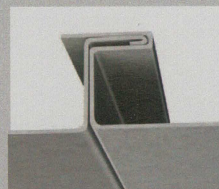
WS-100 AFTER LOCKING