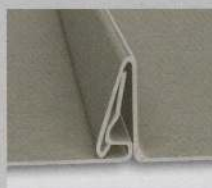
SLZ-1000 AFTER LOCKING