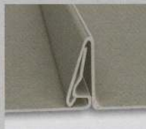
SLZ-1000 AFTER LOCKING