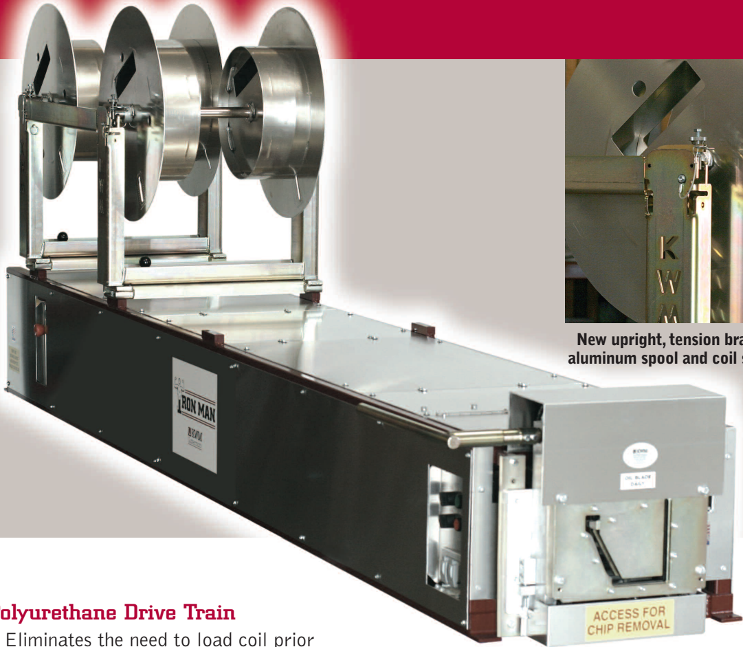
New upright, tension brake, aluminum spool and coil scale