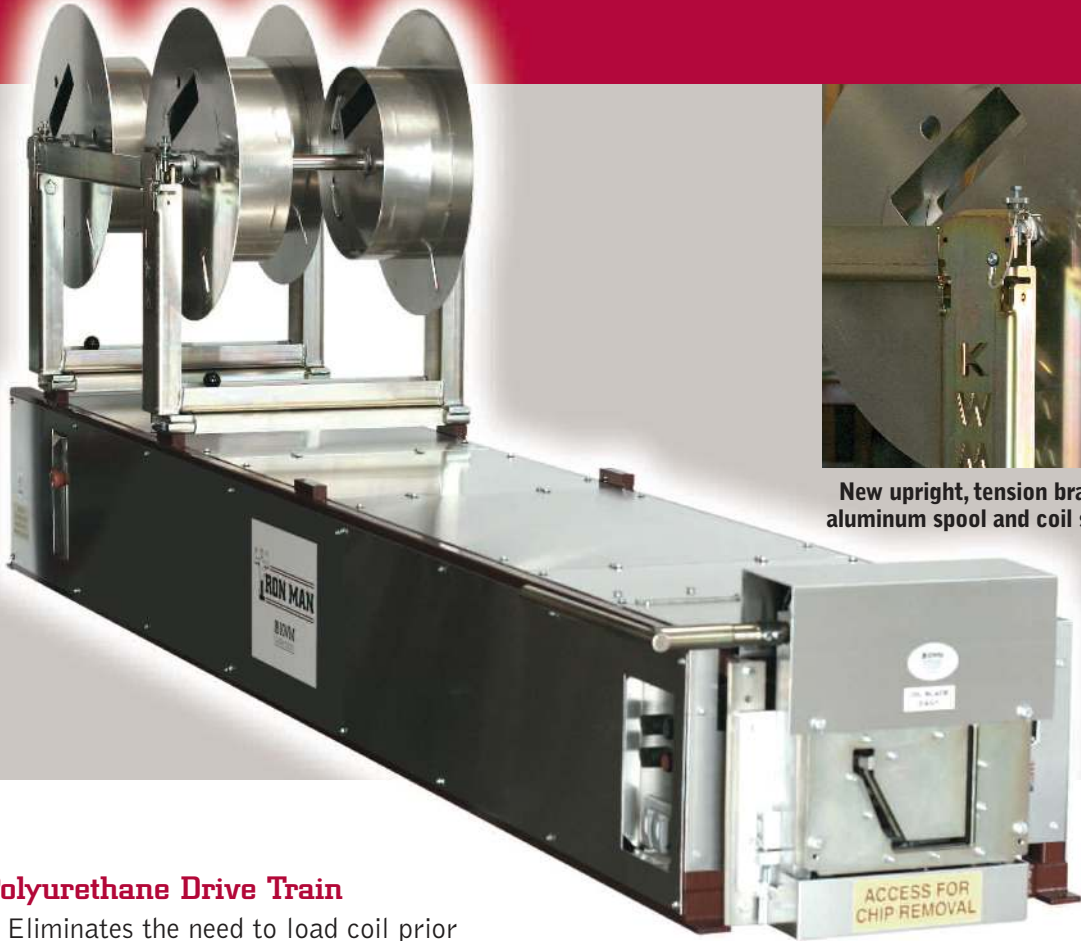
New upright, tension brake, aluminum spool and coil scale