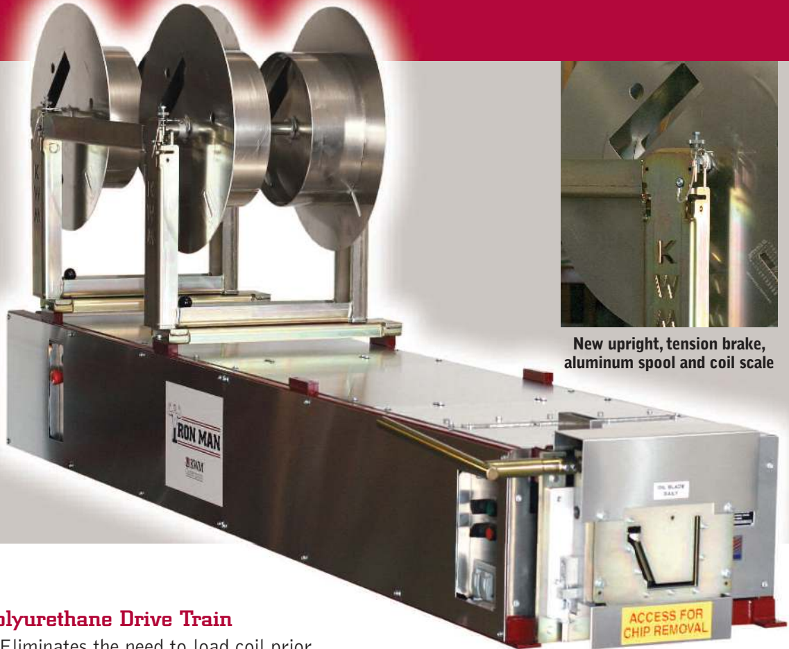
New upright, tension brake, aluminum spool and coil scale