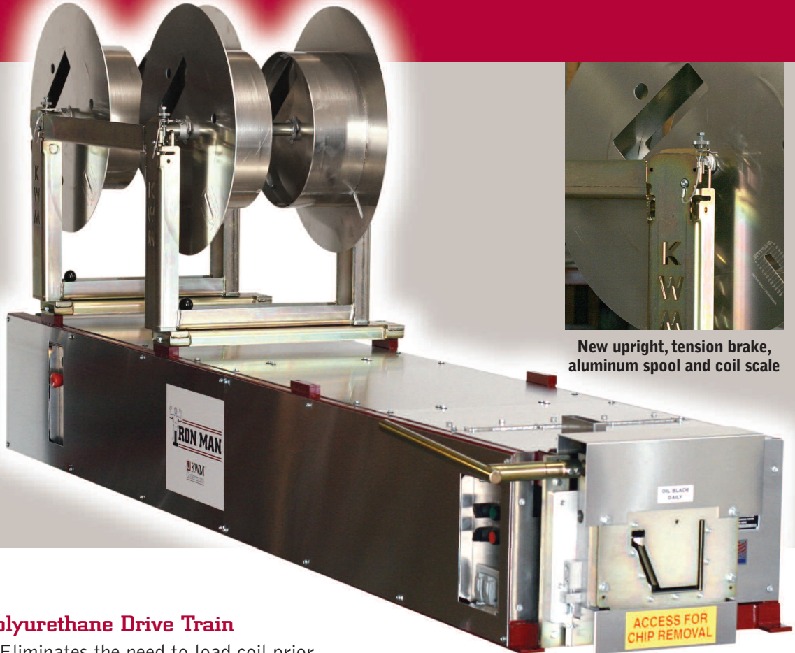
New upright, tension brake, aluminum spool and coil scale