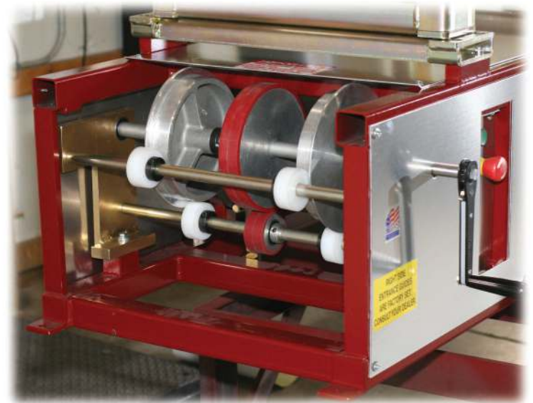
Easy feed entrance guide