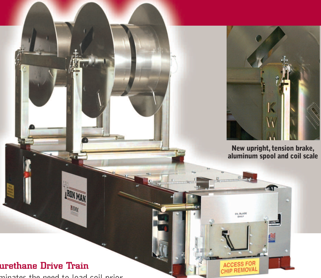
New upright, tension brake, aluminum spool and coil scale